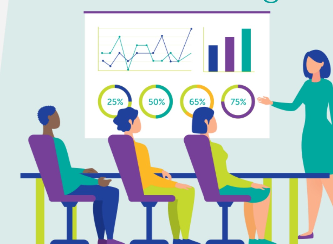
Virtual Instructor-Led Training